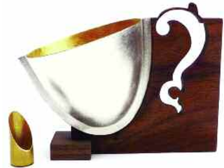
'Vintage Salt Cellar', 2008, stg silver and walnut, 10 x 15 x 9 cm