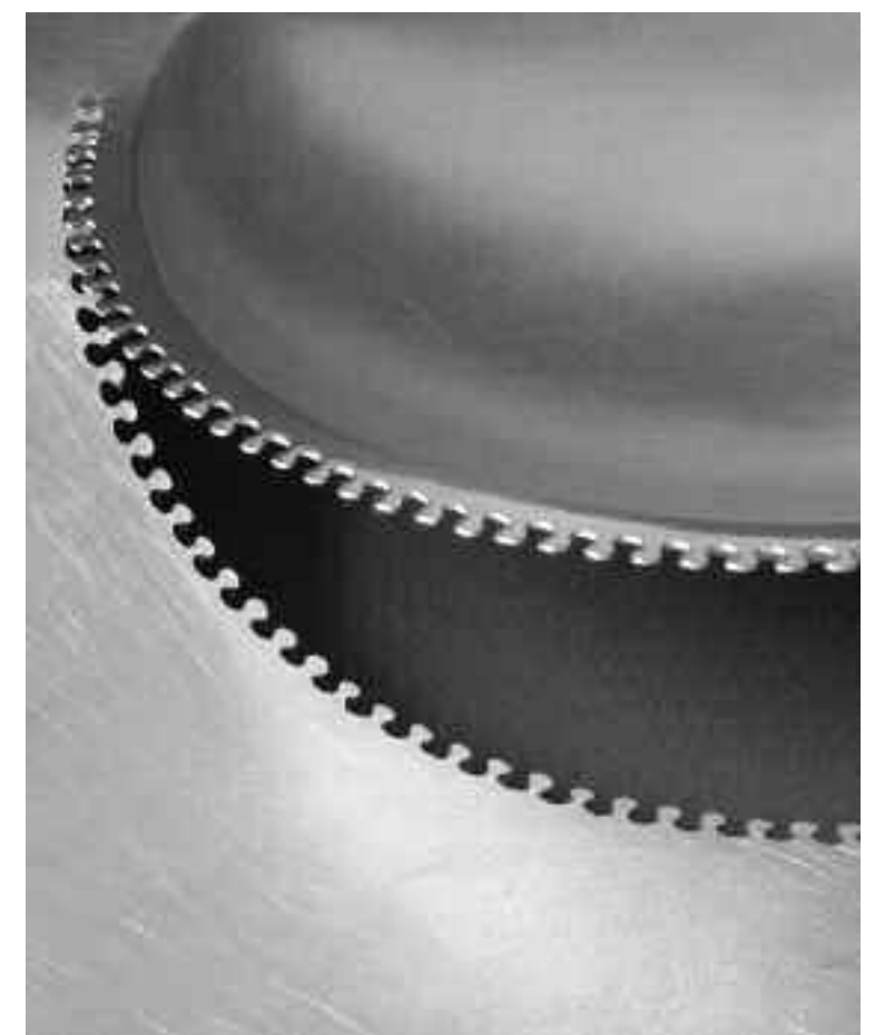
Zip teeth detail

Until recently, despite or because of his family, he has steered clear of his cultural background in both his education and his practice. 'I felt people expected this stance, but I decided having pushed the contemporary I could go back to my roots.' His "Lota" series of vessels relate to a common form of water vessel in India. In 2005 he developed a series of gifts for visiting dignitaries at the invitation of the Indian Government. His subsequent designs were derived from an amalgamation of Indian lotas and 18th century coffee and cocoa pots in the Victoria & Albert Museum. They poured towards the body, rather than as traditionally away from it, which is reflected in the placing of the wooden handles at an angle of 45 degrees. His collections for 2011 of "Hand Held" vessels launched