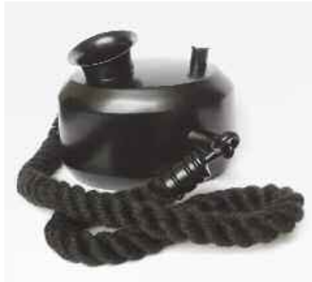
'Hanging Wall/Tabletop Vessel', 2010, powder coated brass, ht 22 cm