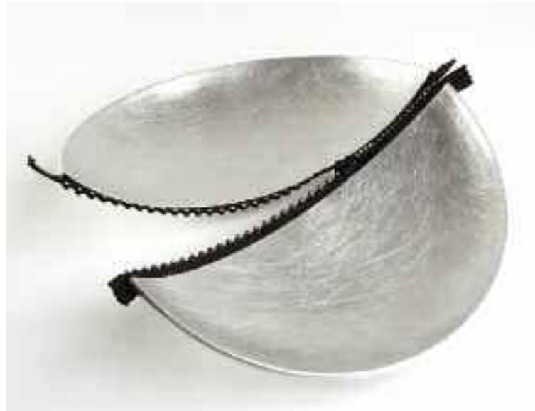
'Zip Bowl', 2000, anodised aluminium, spun, cut and assembled, diam. 30 cm