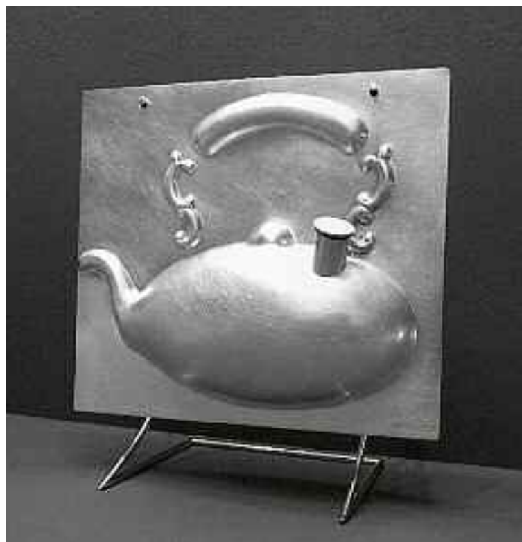
'Ice Coffee Pot', 2008, stg silver, with detachable silver stand, 30 x 34 x 15 cm

object on its head. 'I'm very thoughtful about my work. It's both my downfall and my strength. I spend a long time being meticulous about decision making. A piece can stay on my bench for two years. It has to be right when I put it out there. I commission myself and set my own boundaries, constantly pushing my making skills by using basic skills in non-traditional ways. Much of my work looks as though it has been manufactured by industrial processes or laser-cutting, but it hasn't. To me it's important that I can do the work by hand and celebrate my skills in ways that are innovative.' His working method relies on his keen understanding of process and the handling of material, which comes from his early training.