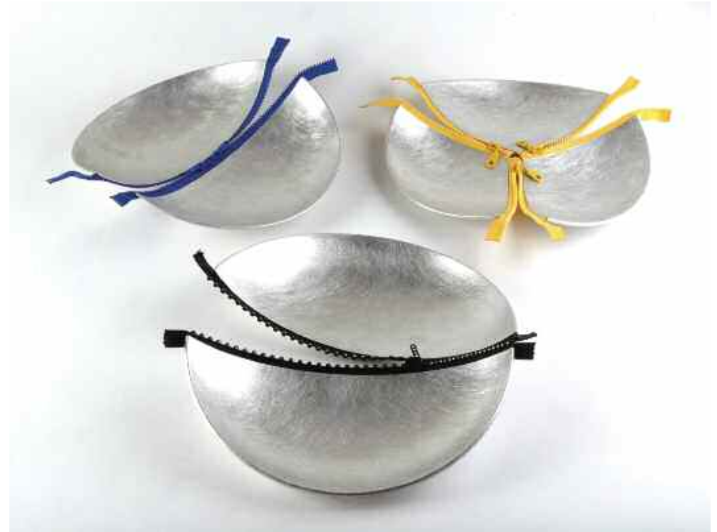
'Zip Bowl Series 1', 2000, anodised aluminium, spun, cut and assembled, two sizes, diam. 30 cm and 50 cm

He went onto to do an MA at Birmingham where he developed "Un-zipped", a series of vessels which unzip to relate to the original flat piece of metal. It is an exploration of the sophistication of the zipper, "juxtaposed" within the unexpected context of tableware. He relishes re-examining