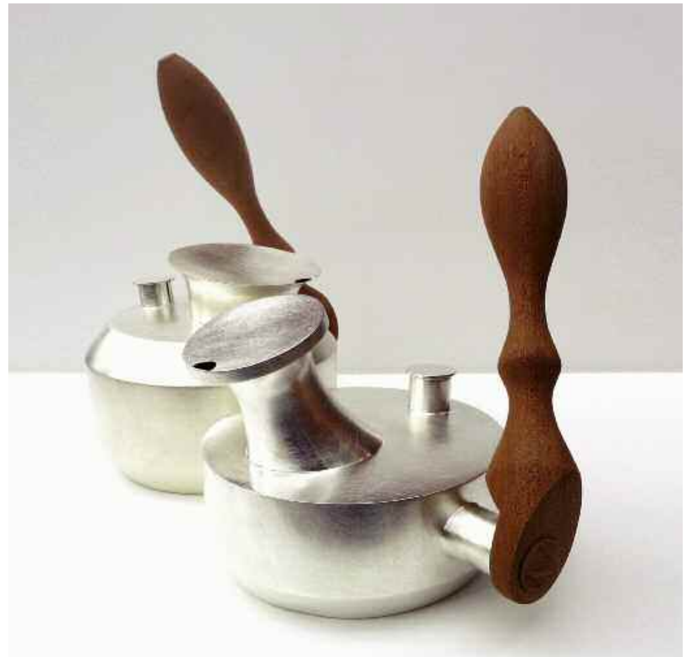
'Hand Held Lota Vessels', 2009, stg silver, sheet fabrication, raising, and assembly, lathe-turned walnut, each diam. 18 x 22 cm

He enjoys the challenge of problem solving, but the real thrill is what he calls "juxtaposing" or turning an idea or