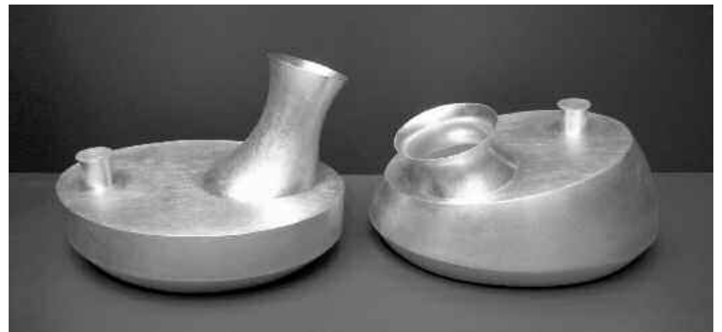
'Hanging Wall/Tabletop Vessels', 2010, stg silver, sheet fabrication, raising, assembly, 20 x 22 x 28 cm