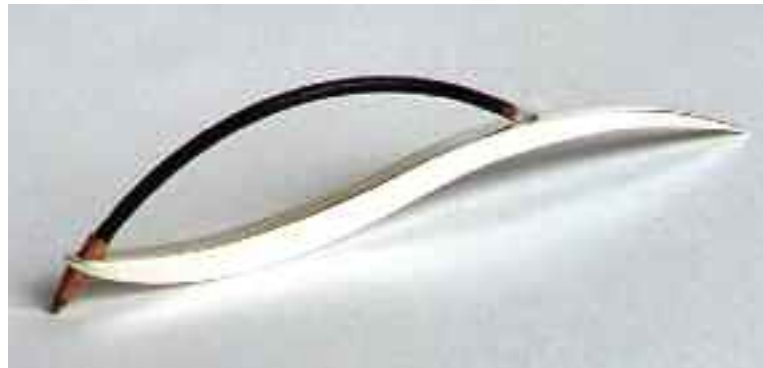
'Writing Instrument' (inspired by the Quill), 1999, stg silver, length 16 cm