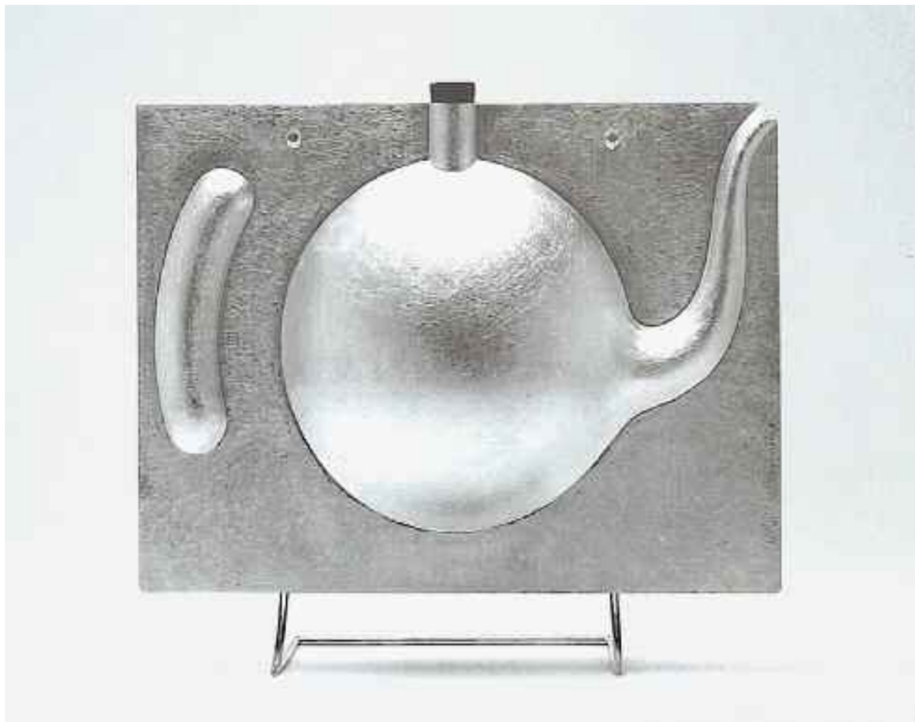
'Ice Teapot', 1998, functional table piece in stg silver, with detachable silver stand, 35 x 30 x 15 cm