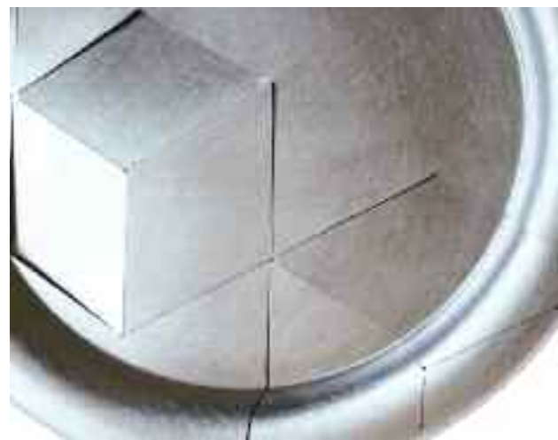
'Cubism' (detail), 2011, wall plate, stg silver, diam. 26 cm

during the London Design Festival 2010 at the Victoria & Albert Museum, London are heavily influenced by his interest in architecture. Their oval or circular forms are surmounted by a selection of cooling tower-like forms or strange protuberances in silver and wood. Yet they pour perfectly.