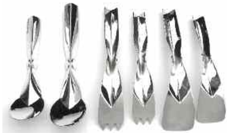
'Folding Cutlery', 2002, stg silver, fold-formed, soldered, polished, 18 x 5 cm